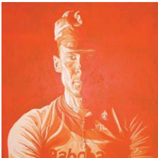
Levi Leipheimer 2006 Acrylic on wood 24"x24"