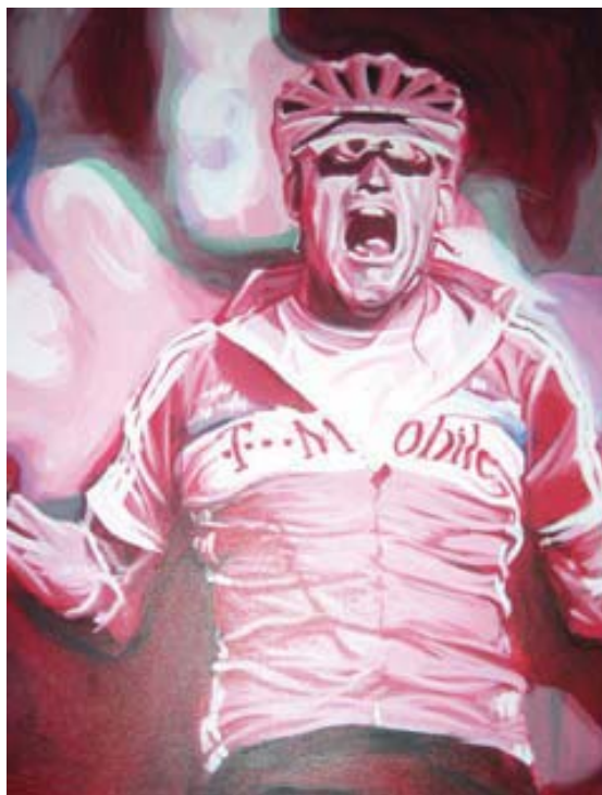
Wesseman 2007 Acrylic 28"x22"