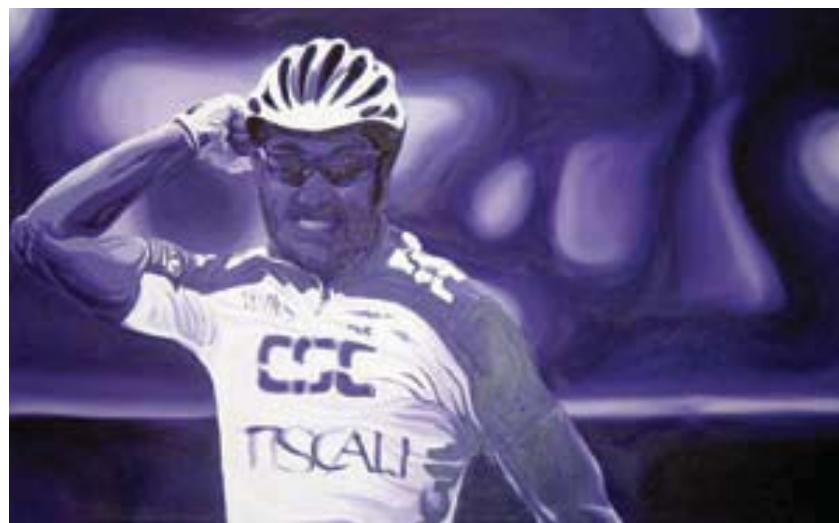
Jalabert 2005 Acrylic 28"x48"

I spent my youth cycling the green mountains of Wales. Having married a beautiful American, I now find myself riding in the concrete jungle.